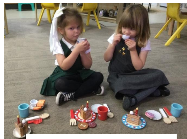
Creating a picnic counting to 3 items

We have been developing our understanding of measures and patterns. We compared the size and length of items around the classroom and outdoors and created our own patterns using a range of resources. We have enjoyed baking cakes and bread using accurate counting